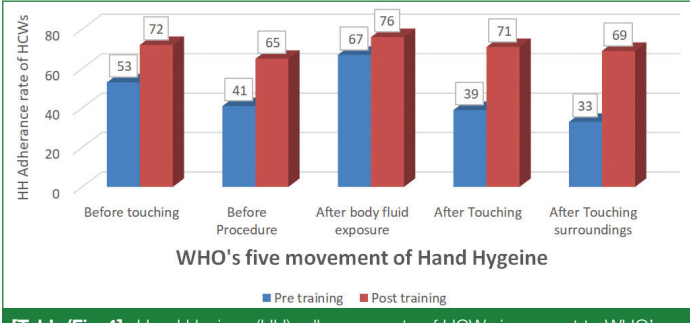
[Table/Fig-4]: Hand Hygiene (HH) adherence rate of HCWs in respect to WHO's five movement of Hand hygiene.

Pre and post-training HH adherence rate was highest in after body fluid exposure movement. However, least HH adherence rate pretraining was with movement 5 (after touching patients' surroundings) and post-training was with movement 2 (before procedure) [Table/Fig-4]. Preferred method for HH was hand rub. Pre and post-training it was used in {84/94 (89%) and 136/154 (88%)}, respectively.